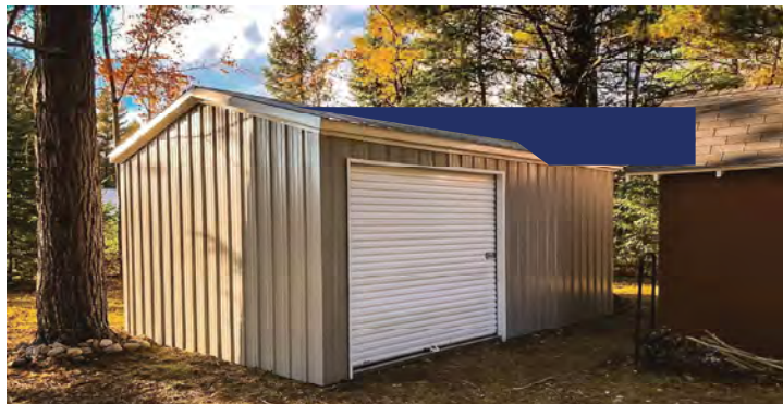
12'x 20'x 7' All Vertical w/1-6'x 6' garage door on side