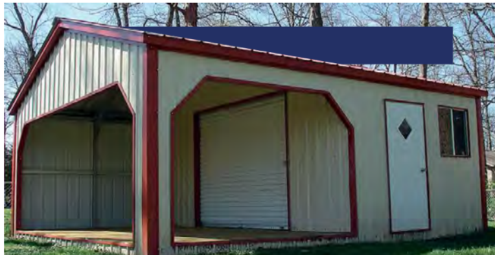
18'x 20'x 8' All Vertical Panels w/1-8'x 7' garage door & walk in door & Window