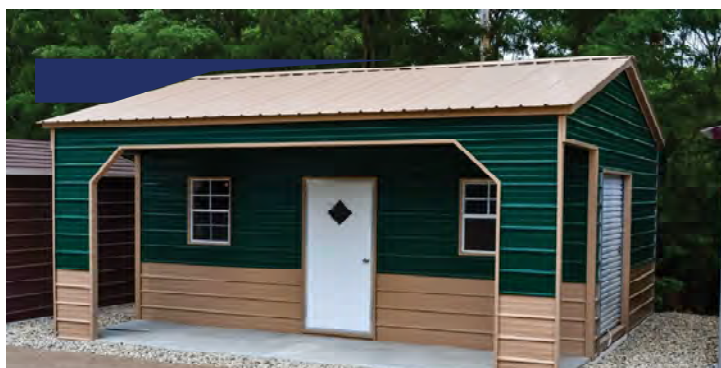
18'x 20'x 8' Vertical Roof w/1-6'x 6' garage door & walk in door on side, 2- 24Wx36H Windows