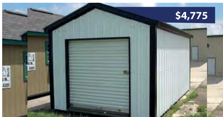
10'x 12'x 7' w/1-6'x 6' garage door & All Vertical Panels