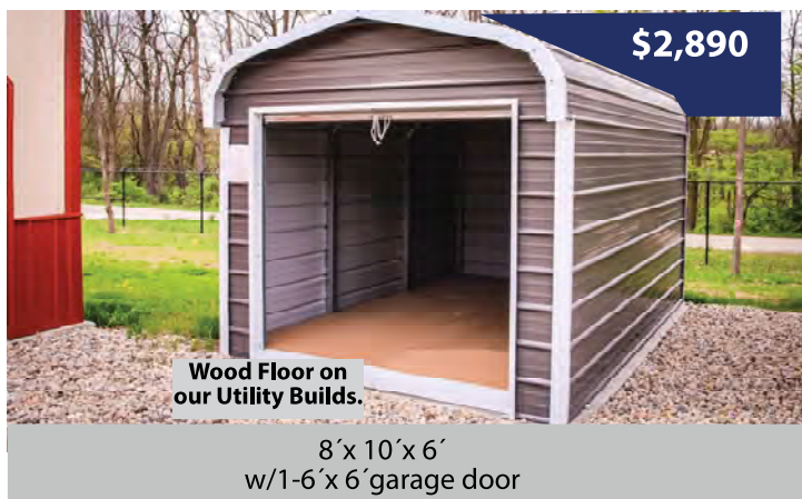
8'x 10'x 6' w/1-6'x 6' garage door